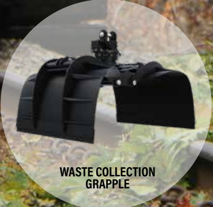
WASTE COLLECTION GRAPPLE