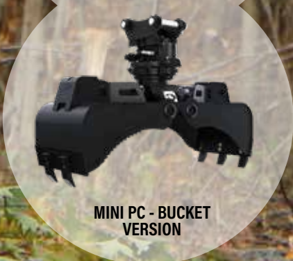
MINI PC - BUCKET VERSION