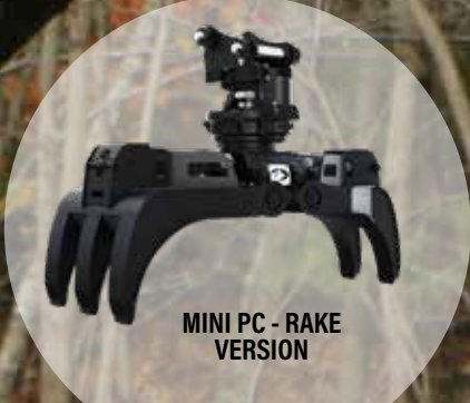
MINI PC - RAKE VERSION