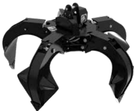
POLY GRAB GRAPPLE