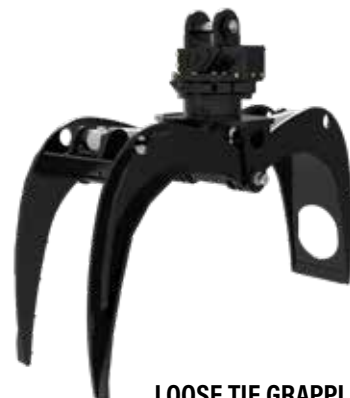
LOOSE TIE GRAPPLE